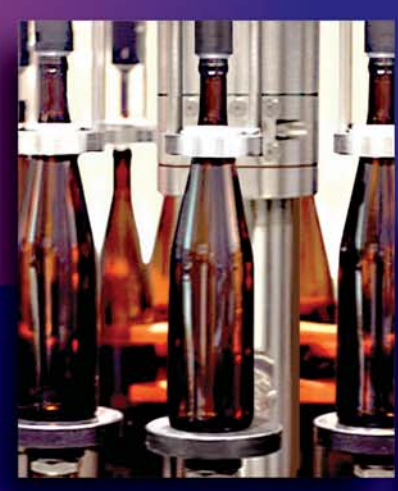
Paints, Inks & Coatings